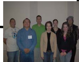
Youth Worker's Conference 2005