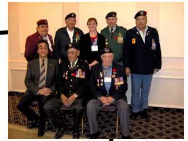
SFNVA Gathering 2004

RAG-Top would like to coordinate your Gathering, conference, workshop or seminar. With a strong network of potential speakers, RAG-Top will ensure your event is a success.